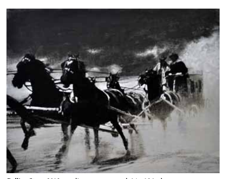
Bullion Stage, 2012, acrylic on canvas panel, 14 x 18 inches

The American West as a topic, or as a subject swept up by the popular imagination, has run a long course and it has not run out. It is still being explored, deconstructed and reconstructed. The momentum