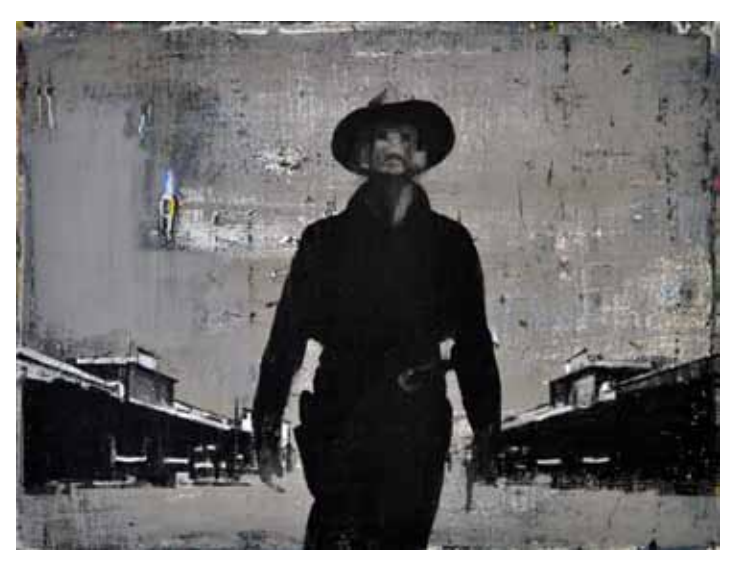
How Lonely Does It Get?, 2012, acrylic on canvas panel, 12 x 16 inches