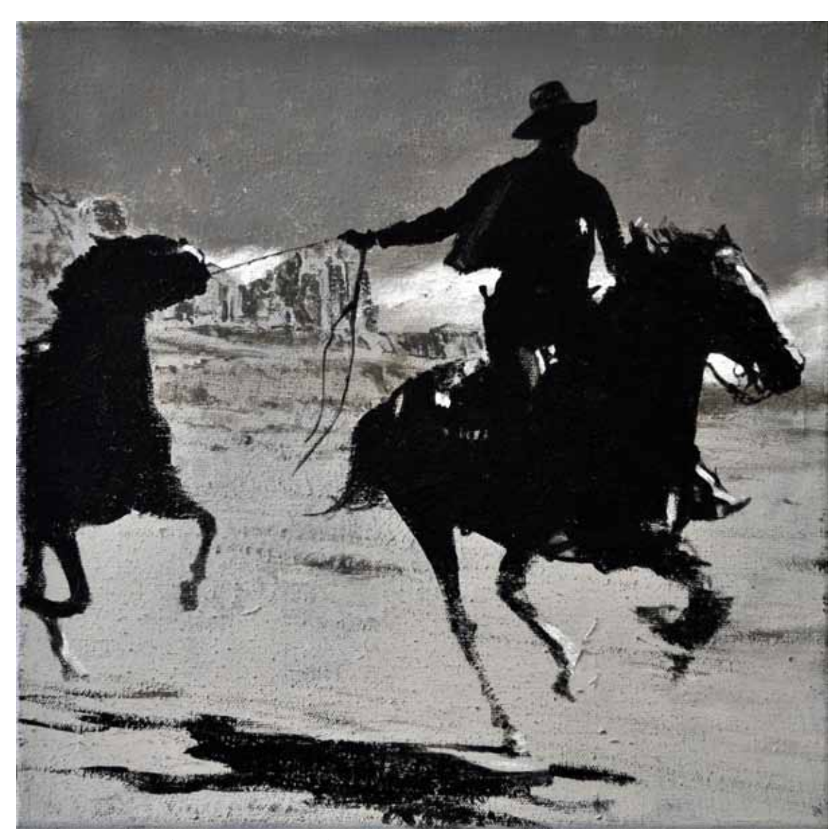
Steady Rider, 2012, acrylic on canvas, 12 x 12 inches